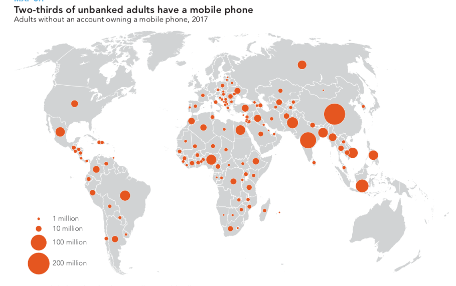
Sources: Global Findex database; Gallup World Poll 2017. Note: Data are not displayed for economies where the share of adults without an account is 5 percent or less.